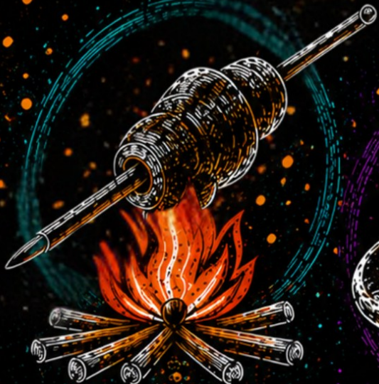
TRADITIONAL ROO TAIL

Join Cue Youth for a celebration of culture, community and connection.