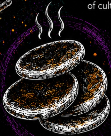
TRADITIONAL JOHNNY CAKES