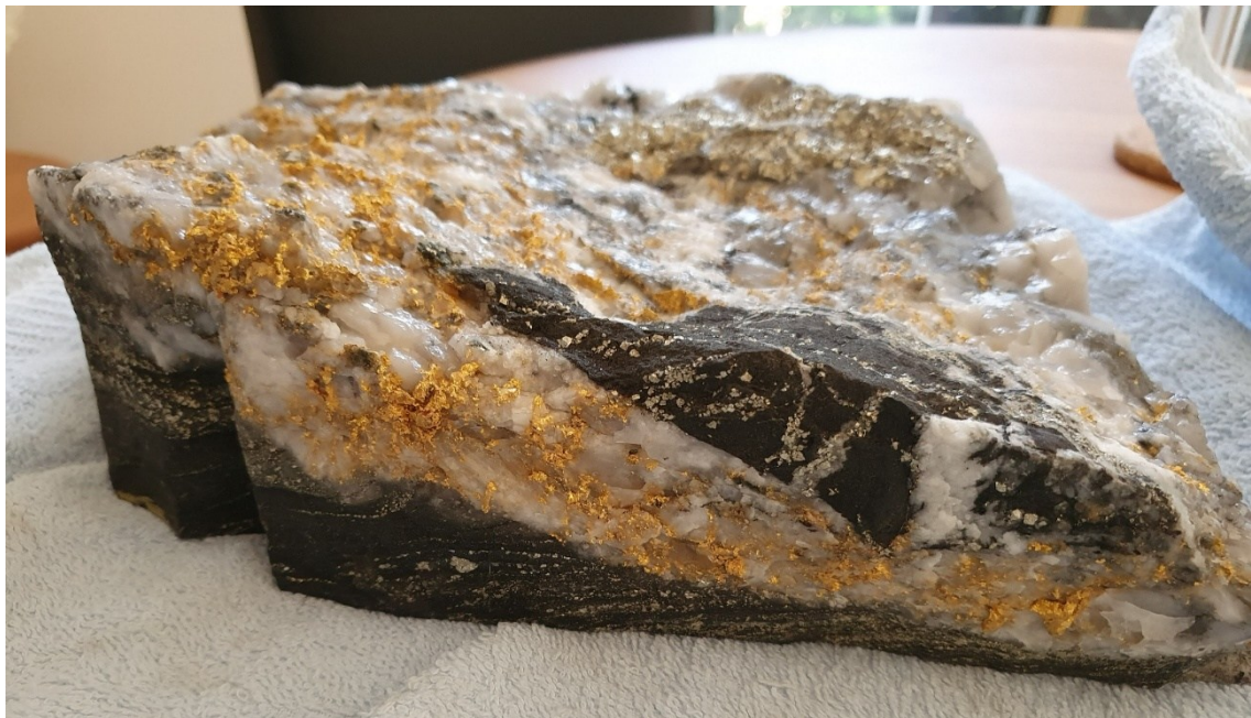
An 8 kg gold specimen of the Father's Day find after initial sawing in the workshop of Desert Fire Designs.