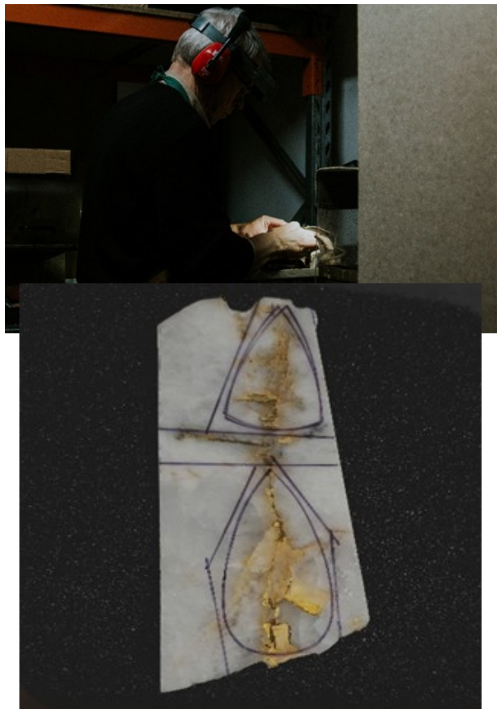
Sawing out preforms marked out on the diamond wire sawn, 2.8 mm thick slabs of gold veined quartz.

In the meantime please visit our website at: desertfiredesigns.com