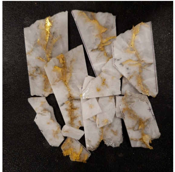
Slabbed gold veined quartz from the Father's Day find, Beta Hunt mine.

The material from the now legendary Beta Hunt Mine, at Kambalda, is some of the best that's available today. In fact, it really is world-class!