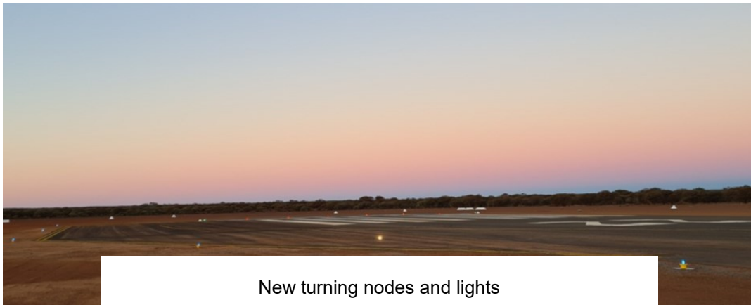
New turning nodes and lights

Please be advised, Westgold are still not allowing prospecting on any of its tenements in the Cue or Meekatharra regions. The main reasons for this is that we are either working or preparing works on many of them and it is just not safe.