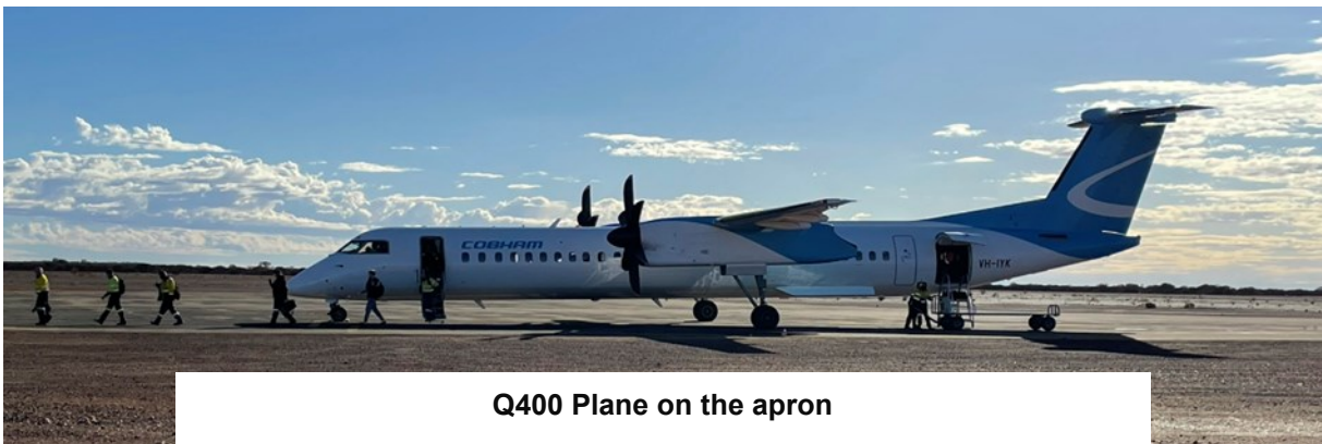
Q400 Plane on the apron

After lots of work in the background from the team on the Council, we are now flying 3 flights per week with Cobham, utilising their relatively new 76 seat Q400 aircraft, and one small plane a week – creating significant benefits to the workforce in more comfortable and quicker flying times.