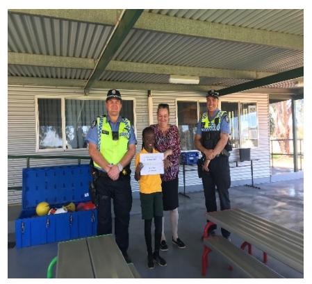
TEAM WORK at Cue Primary = RESPECT + RESPONSIBILITY + RESILIENCE